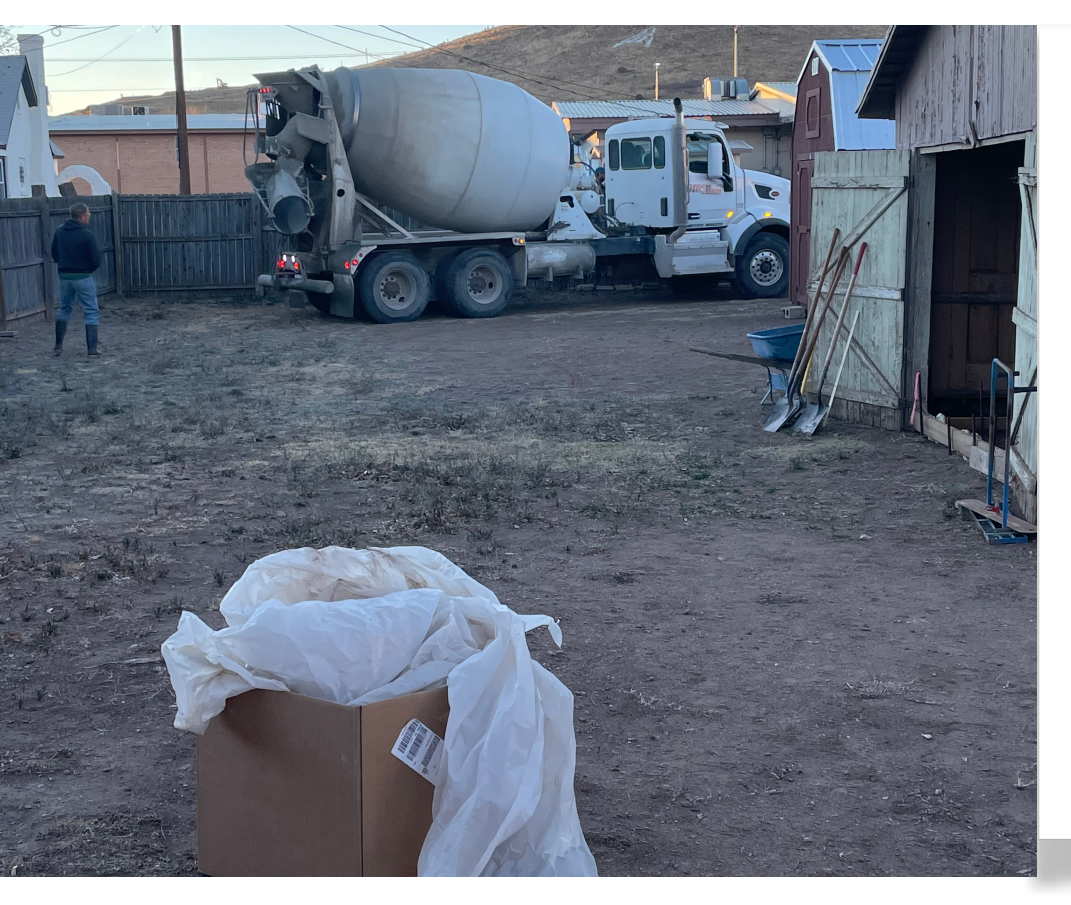
Why is a cement truck maneuvering in our backyard? Ask Greg.