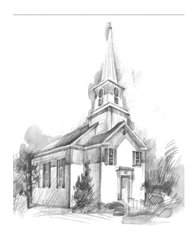
Ordinary people serving an extraordinary God.