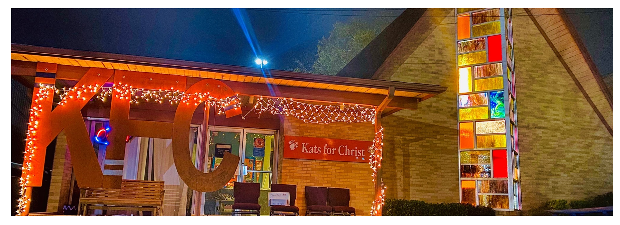
Our Huntsville brothers and sisters in Christ will be visiting during Spring Break. Come worship together next Sunday, March 12, 2023. A meal and devotional are planned for the evening in the annex.

Kats For Christ is a Huntsville church of Christ ministry serving Sam Houston State University for more than 60 years. With the use of a building that is now in the heart of the campus, Kats For Christ functions as a missional outreach to the nearly 25,000 students of the university as well as a home away from home and discipleship avenue for those that already believe. Over the decades the Kats For Christ has been involved with the university in free meals, Bible studies, benevolence, service work, and just about anything you can imagine serving the Lord. Currently we operate with an open building for most of the week that provides wi-fi, a kitchen, bathrooms, study areas, bibles, spiritual books, a shower, and comfortable sitting areas as well as 4 bible study/worship times a week, daily common prayer, separate student run Bible studies, integration into the local church, service work, an open door to the campus ministers office, and bi-weekly special events. We draw in people from varied stages of faith backgrounds to seekers of all kinds. Community is especially important to us and we often say: "We do the dirty work of community".