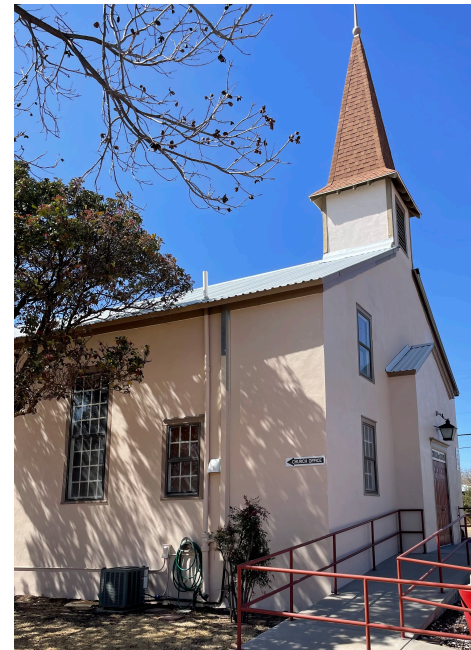
275 hours, 60 tubes of caulk, and 45 gallons of paint later, the church building has a fresh, cared-for look to it. Thank you, Sean, for restoring our building!

Let's meet together for fellowship, food, and the word! Hope to see you then!