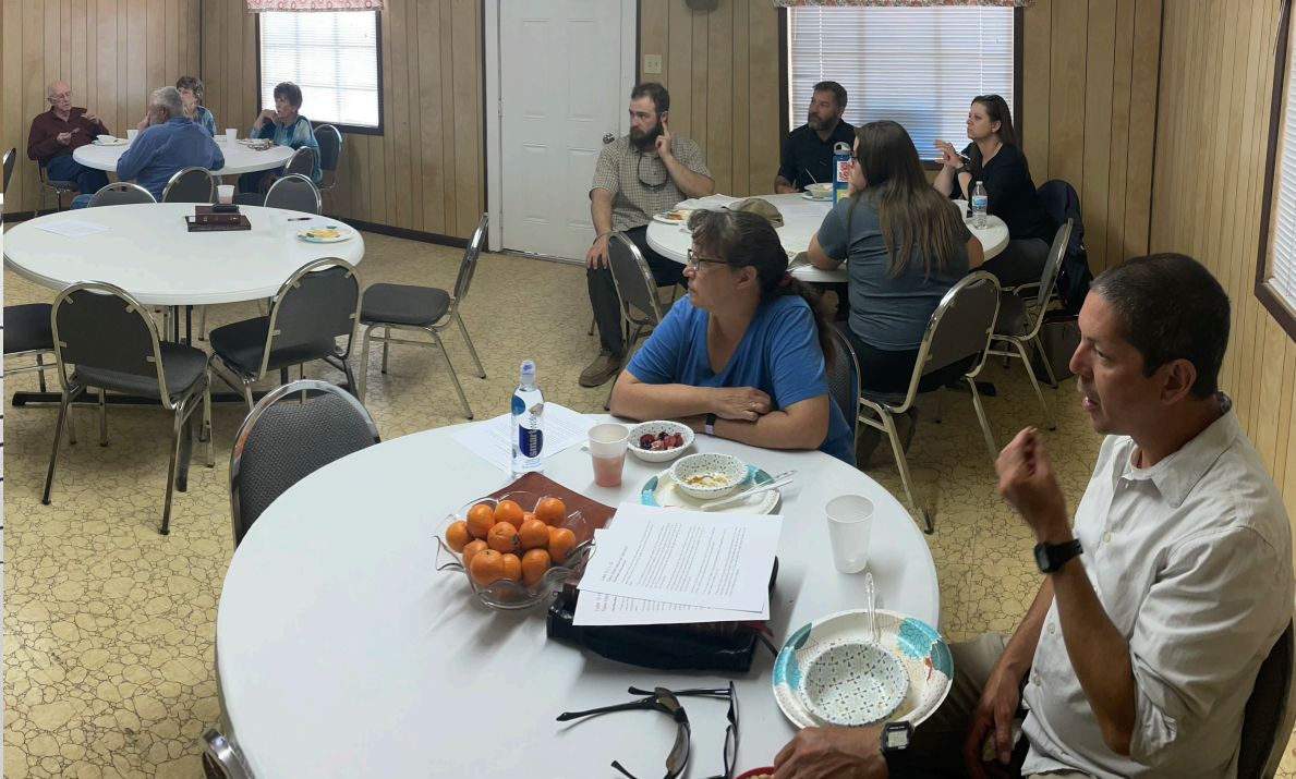
Feasting on great food and the Word of God.

Jesus answered, "It is written: "'Man shall not live on bread alone, but on every word that comes from the mouth of God.'" Matthew 4:4