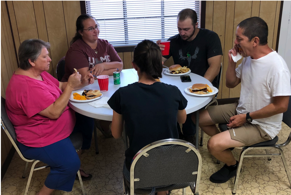
STILL reaching out on Friday nights! "Game night" reaches college-age students and community members. Thank you to our members who support this effort.