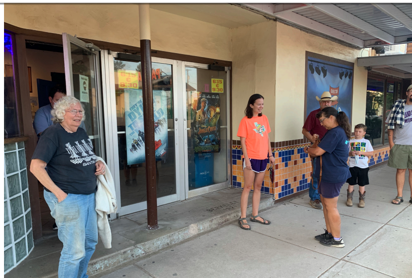
“Movie Night” strikes again! Another round of fun for those interested in being around each other on Friday nights.

The point of the example illustrates confusion about overall credit and praise. God is the one setting “kind after kind” in motion (Gen. 1:29) and ultimately gets credit because credit is due. As you enjoy the season of flowers, be sure to give planters and caretakers their due (for the process is tedious), and include the one who started the process.