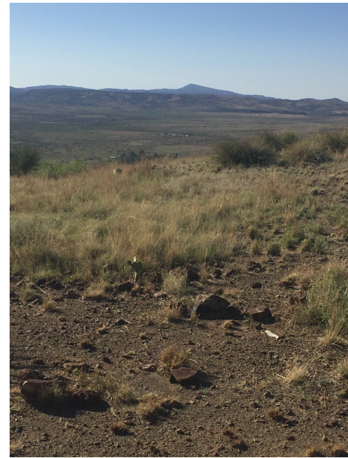
Davis Mountains Scenic Loop